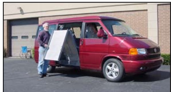
The amount of effort required to lift this AV78 (Aluminum Van Ramp) is under 20 pounds, making it very easy to operate.