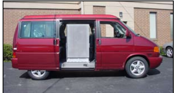
The AV78 (78" long aluminum van ramp) in the side door of a Volkswagen Eurovan.