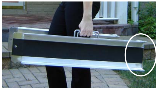
Easy-carry handles reduce finger and wrist stress.