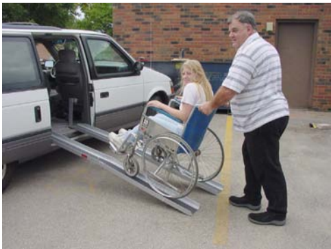
Many of today's minivans have doors that are too narrow to accommodate a standard size ramp. The Handi-Traks can adjust to any door width.

Handi-Traks can save your back when loading and unloading your vehicle. They are easy to use and easy to store when not in use.