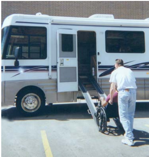
Ten foot long Handi-Traks work with the narrow door of an RV. (Make sure the wheelchair will fit in the door).