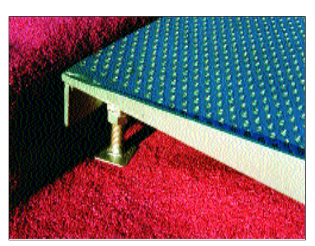
Above: Detail view of the adjustable leg on the Stand-Alone Threshold Ramps. For 3 To 9 Inch Rises. Please specify required rise when ordering.

All of our Threshold Ramps are lightweight and can be installed with minimum effort by one person. Non-skid surface is included on all aluminum Threshold Ramps offering safe and easy access to doorways.