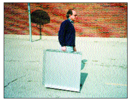
Above: The ALPR5 5 foot Ramp is easily transported by 1 person.

Our 10 and 12 foot ramps come standard with a removable hinge pin, which increases functionality and portability. This option is available on any of the other ramps for a small additional charge.