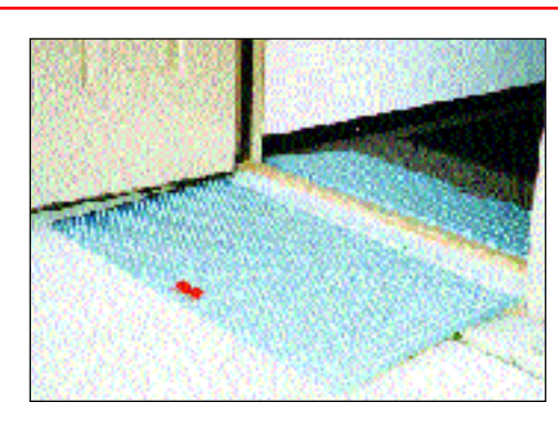
Right: The Small Step Entrance Threshold Ramp Two-inch rise made acces sible with the TR2 model.

Non-skid surface is included standard on all aluminum Handi-Ramp Threshold Ramps. offering safe and easy access to doorways.