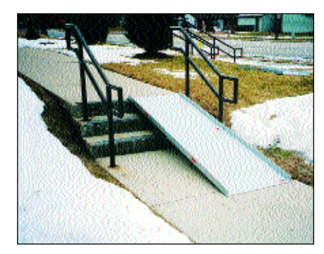
Above: The ALPR7 (7 foot) Ramp in use on a standard 3 stair barrier.

Handi-Ramp® has been committed to serving the physically challenged community for over 40 years! If you have any questions that have not been answered by this brochure, phone 800-876-RAMP, fax us your questions at 847-816-8866, E-Mail: HandiRamp@aol.com or "Visit us on our Web Site at http://www.HandiRamp.com. Please let us know how we may help.