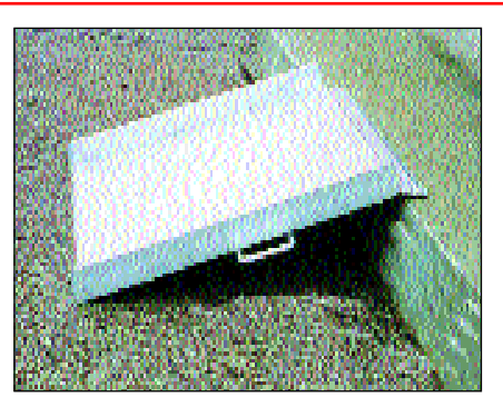
Right: Our Easy-carry handles enable comfortable transportation and set-up.

All of our Aluminum Curb Ramps are lightweight and can be easily transported by one person. Non-skid surface is included on all Handi-Ramp Aluminum Ramps offering safe and easy mobility.