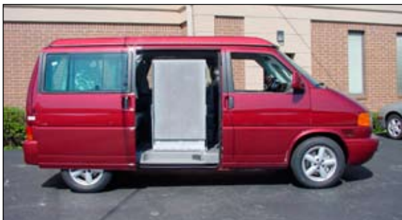
The AV78 (78" long aluminum van ramp) in the side door of a Volkswagen Eurovan.

Van Ramp installation does not require modification to your vehicle so the resale value of your van or minivan is not affected. Portable, rear entrance ramps are also available. Please call us for further information.