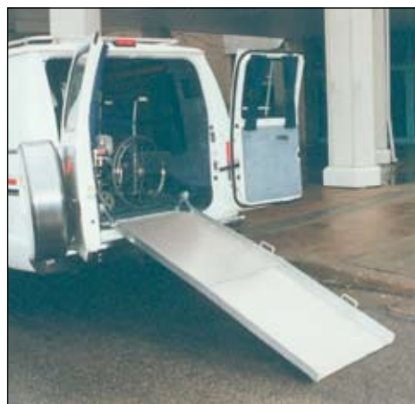
The AV84 (84" aluminum van ramp) mounted in the rear of a full size van.