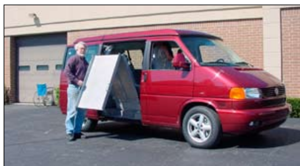
The amount of effort required to lift the van ramp is under 20 pounds making it very easy to operate.