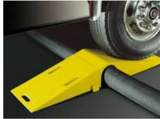
Cable and Hose Bridge System

Operating Temperature: -40F to 120F (-40C to 48C)