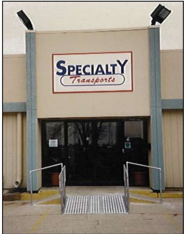
Top: GA access ramp installed at a storefront Left: GA access ramp installed at a facility

Cost: The Handi-Ramp GA Series is a cost-effective investment for a ramp system. Our systems offer safe and easy ingress and egress at homes, churches, businesses and public buildings.