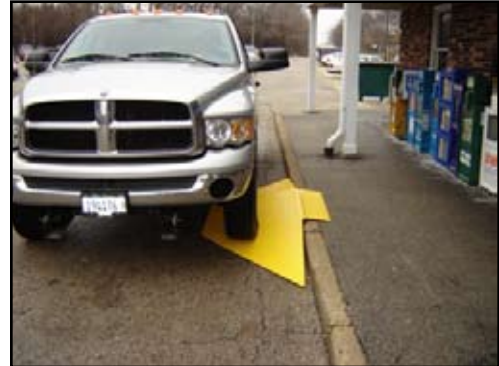
The Handi Curb ramp is strong enough to withstand the weight of vehicles.

The Handi Curb ramp is a low cost solution to ADA compliance for curb cuts. This adjustable ramp allows traffic from all sides to ease up onto a curb. At any location, the Handi Curb ramp can be easily installed where curb cuts are needed. Its heavy duty steel construction is made for durability and longevity. The product features a powder coated finish to keep the Handi Curb looking new and rust free. Hinges along the seams of the ramp allow it to be adjusted to fit any curb at a variety of heights. A nice benefit of the ramp is that it is light enough to be moved by a two man crew in a matter of minutes to any location in where a curb cut is needed.