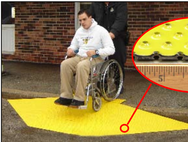
The Handi Curb's high traction material makes it easy to maneuver in wheelchairs or on foot.