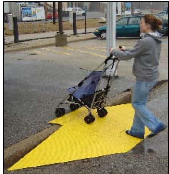
The Handi Curb ramp lets mothers with strollers and bike traffic easily access sidewalks without having to jump the curb.