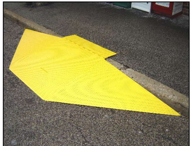
The Handi Curb ramp's sloped design leaves it flush against the curb and unobtrusive to traffic.

The Handi Curb ramp is made of reinforced steel and stainless steel hinges. The surface of the ramp is a high traction raised button material that maintains its traction through ice, water and snow.