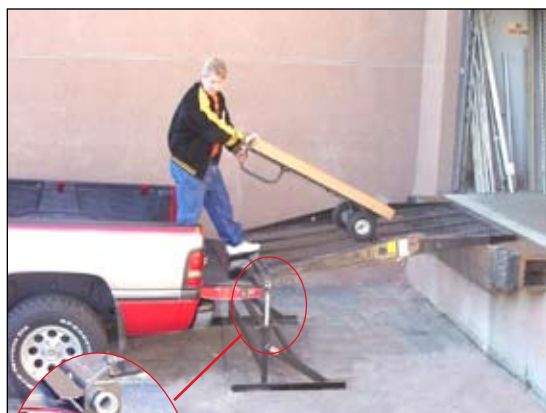
The M-100 with leg set extends your loading dock for easy pickup truck loading.

The M-100 Redi Ramp can be also mounted to a free-standing leg set. This option provides a great transition for loading and unloading pick-up trucks from standard loading docks, or other raised platforms. The legs adjust to the height of the truck (from 24" to 38").