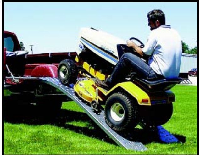
M-1500A Redi Ramps have an arch design for loading low clearance lawn mowers.