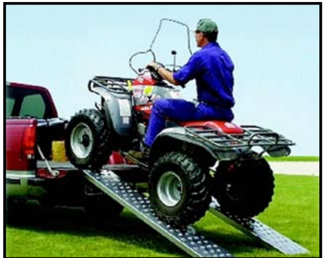
M-1500S Redi Ramps straight design is excellent for ATVs, Motorcycles, and more!