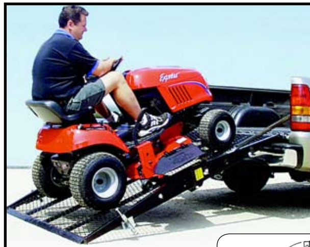
M-100 REDI RAMP: Easily mounts on any standard sized American made pick-up truck, replacing your tailgate.

Installing and operating these strong ramps is easy and allows one person to load and unload quickly. They open as a standard tailgate allowing normal pickup bed access.