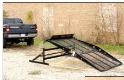
The M-100 and the optional leg set can be used at a fixed location like a construction site, enabling loading and unloading of multiple pick-up trucks using a single ramp system.