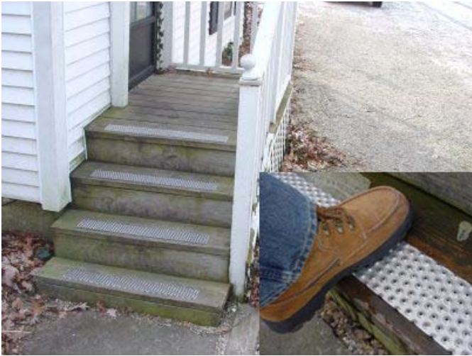
Non-Skid Stair & Deck Covering Safety Tread Strips

Heavy-Duty Non-Slip Surface Designed to Last a Lifetime