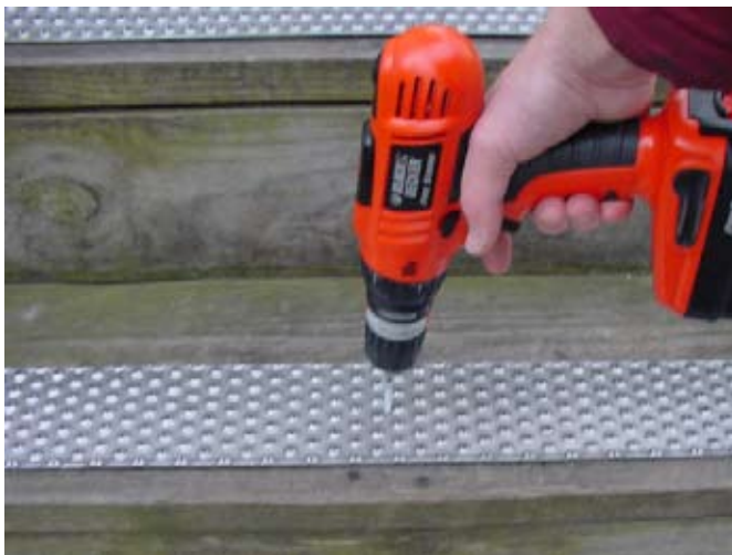
An Inexpensive, Easy to Install, Home Improvement

Indoor, Outdoor, Home or Commercial Aluminum Non-Skid Surface Safety Tread Coverings for Wood, Concrete or Aluminum Stairs and Decks