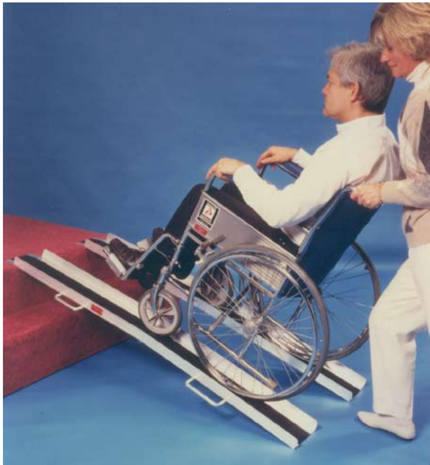
Handi-Trak systems are convenient, portable tracks available in a range of lengths for maximum accessibility.

Simply unfold your Handi-Traks to use them and then fold them to carry or store them.