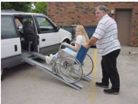
Many of today's minivans have doors that are too narrow to accommodate a standard size ramp. The Handi-Traks can adjust to any door width.

Handi-Traks can save your back when loading and unloading your vehicle. They are easy to use and easy to store when not in use.