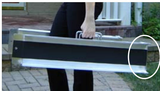
Easy-carry handles reduce finger and wrist stress.