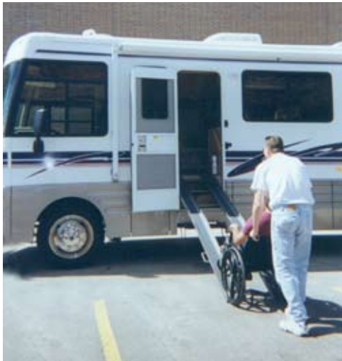
Ten foot long Handi-Traks work with the narrow door of an RV. (Make sure the wheelchair will fit in the door).