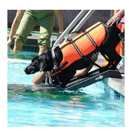
© 2017 PetSTEP International, Inc, all rights reserved. PetSTEP® and HalfSTEP® are registered trademarks of PetSTEP International, Inc.